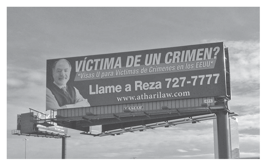
FIGURE 1: ATTORNEY BILLBOARD IN LAS VEGAS, NV, IN 2014, ADVERTISING "U VISAS FOR VICTIMS OF CRIME IN THE USA."