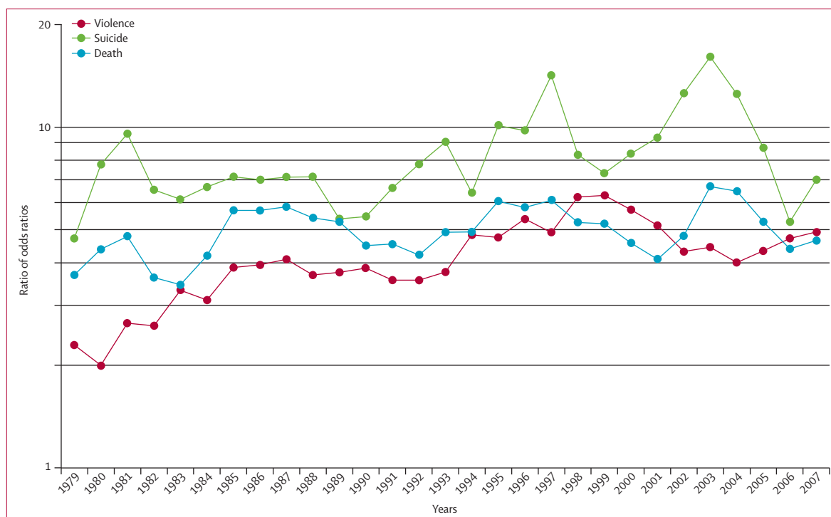
Figure 2: Ratio of odds ratios of adverse outcomes, by year of diagnosis

The graph presents 3-year rolling averages of the ratios of odds ratios of adverse outcomes (comparison of analyses of patients with schizophrenia and related disorders vs unaffected siblings). In statistical analyses, the ratio of odds ratios for conviction of a violent offence increased significantly by 1.1% (95% CI 0.1–2.2%) per year. This ratio of odds ratios also increased, but not significantly, for suicide (1.7% increase per year [95% CI –0.9 to 4.3]) and did not change significantly for premature mortality (0.2% increase per year [–1.3% to 1.6%]).