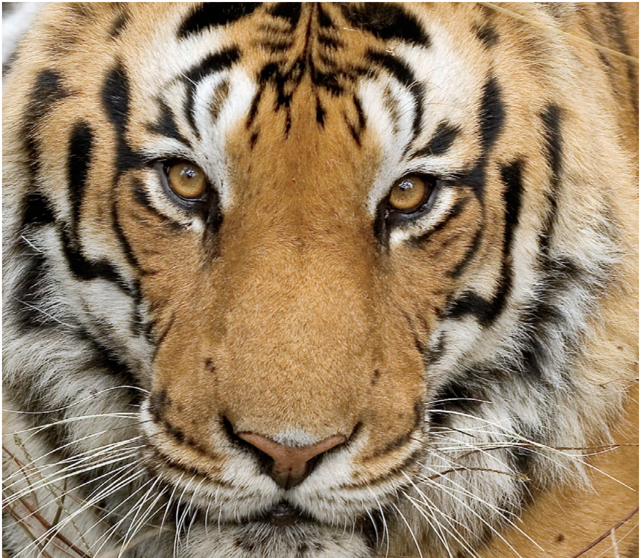
Tiger, Kanha National Park, India

Copyright © 2017 Massachusetts Medical Society.