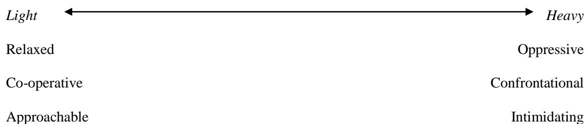
Figure I: The ‘heavy—light’ continuum

Expressed in this way, and as described above, one would expect prisoners to favour prisons that are ‘light’ to those that are ‘heavy’. Yet, in responding to a detailed survey, prisoners in three of the five private sector establishments in our study rated their prison experience consistently more negatively than prisoners in comparable public sector prisons (see Crewe, Liebling and Hulley 2011). Our contention is that, at their most ‘under-weight’, and where staff – and staff authority – were absent , private sector prisons provided a less positive environment for prisoners than public sector establishments which were slightly ‘over-weight’ but in which staff power was ‘present’.